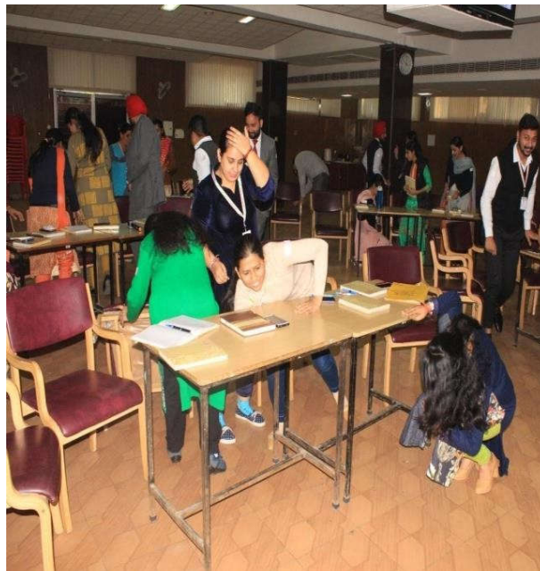
Self-Awareness Workshop held on 3 rd October, 2018