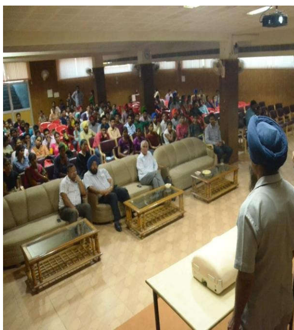
First Aid Awareness Workshop held on 18 th October, 2018