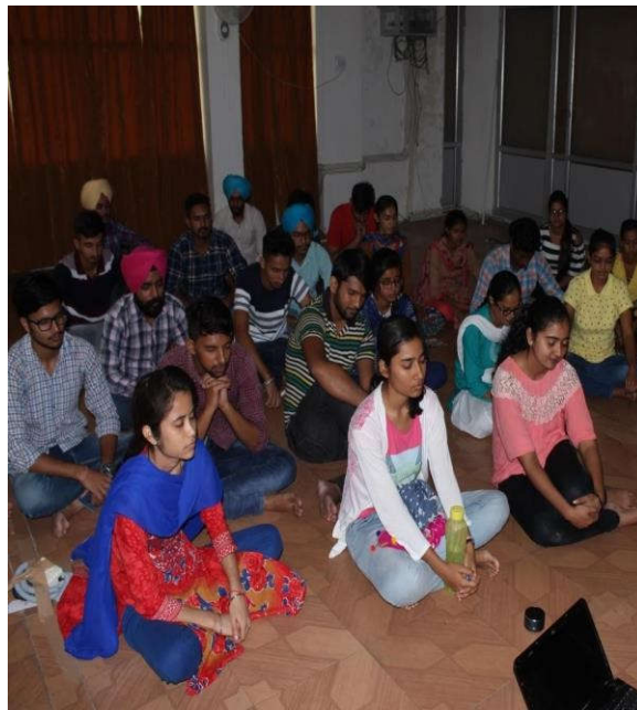
Stress Management Workshop held on 21 st September, 2018