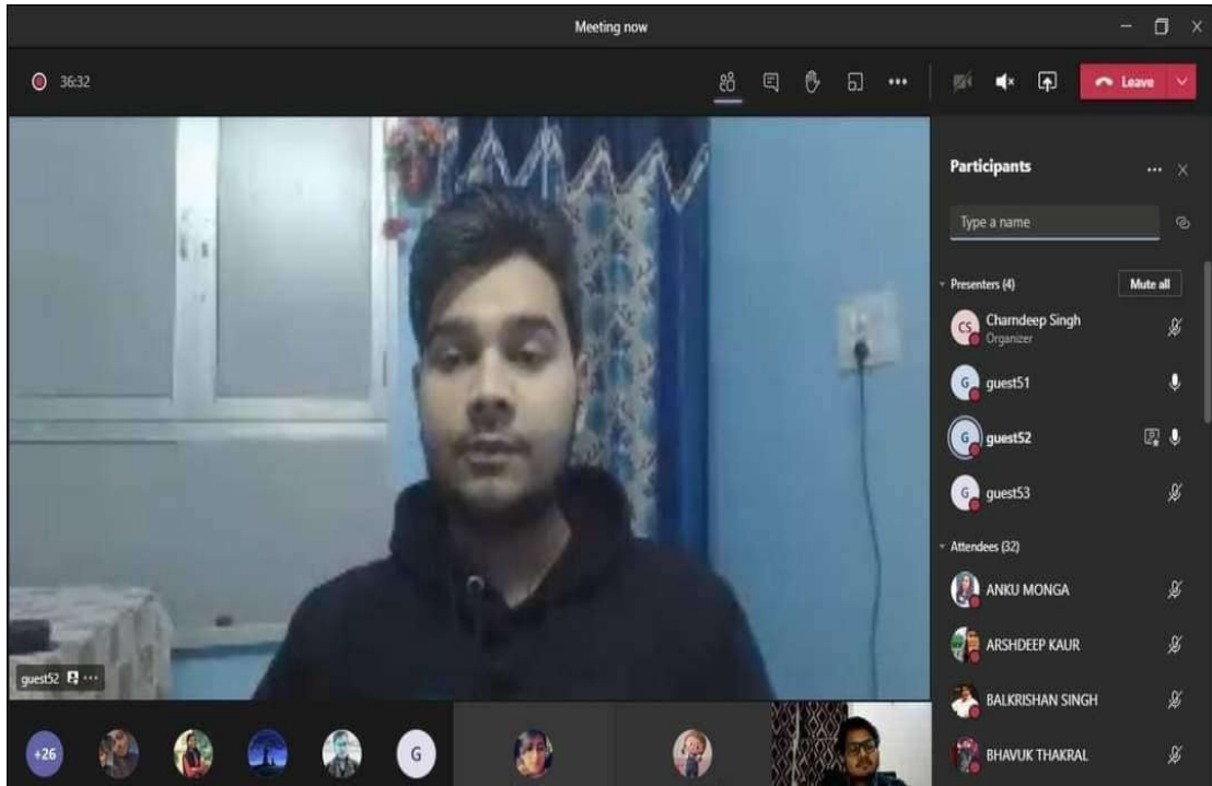
Non-Verbal Communication held on 21 st August 2020