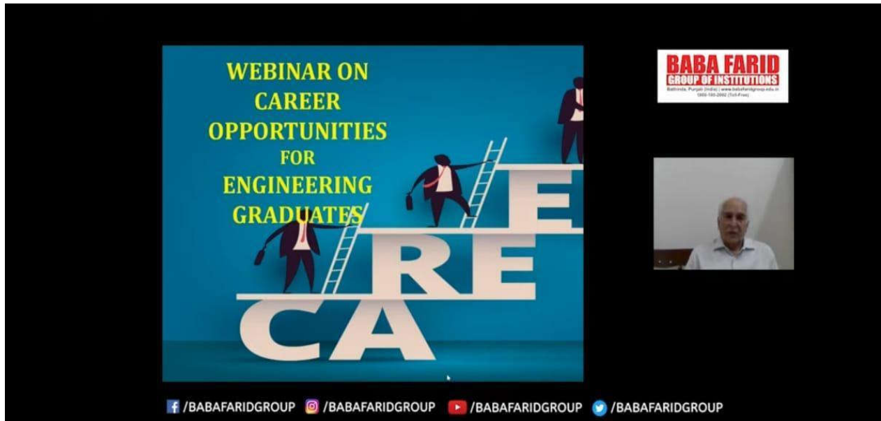
Opening page of the Webinar