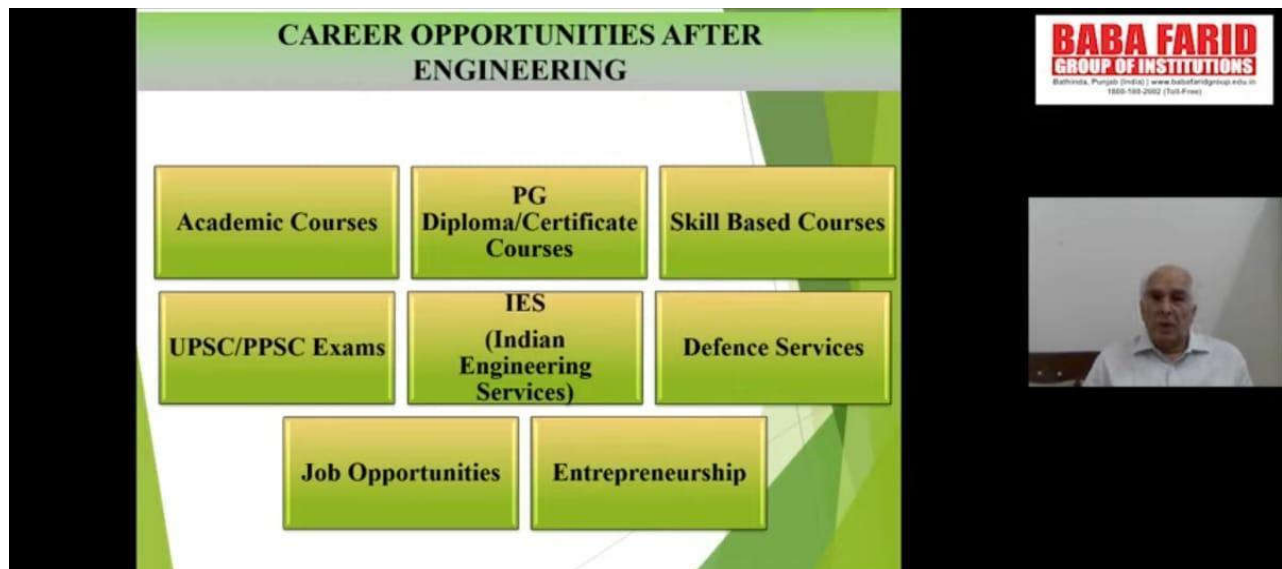
Contents of the Webinar