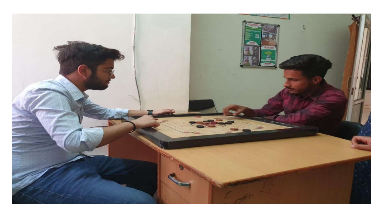
Boys Playing the Carom Tournament Match.

In this Carrom tournament 10 student from CSE,18 students from CE ,5 studentsfrom EE/ECEand 5 students from ME had participated with full enthusiasmand shownsportsman spirit. In the pre-final round Team of CSE, CE and ECE compete with each otherto win the medals. In the final round Team of EE/ECE was declared as the winner and Teamof ME was declared as 1<sup>st</sup> runner up and Team of CE was declared as 2<sup>nd</sup> runner up. All thestudents appreciatedthe eventorganizedbysportsclub ofBFCET.