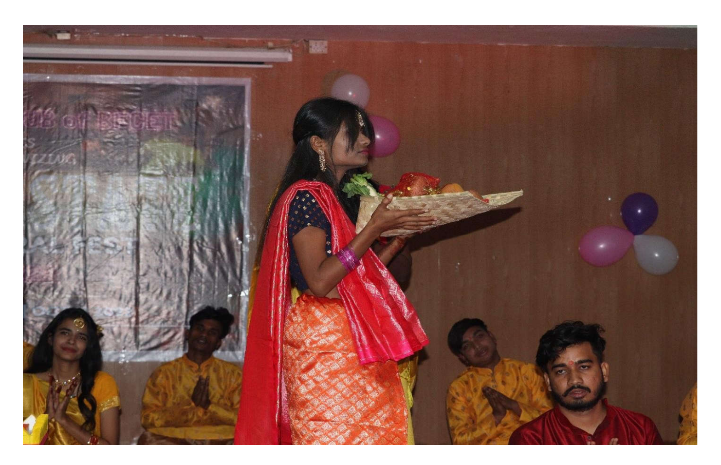
Girl fromBiharstateduringherperformance on thedayofevent