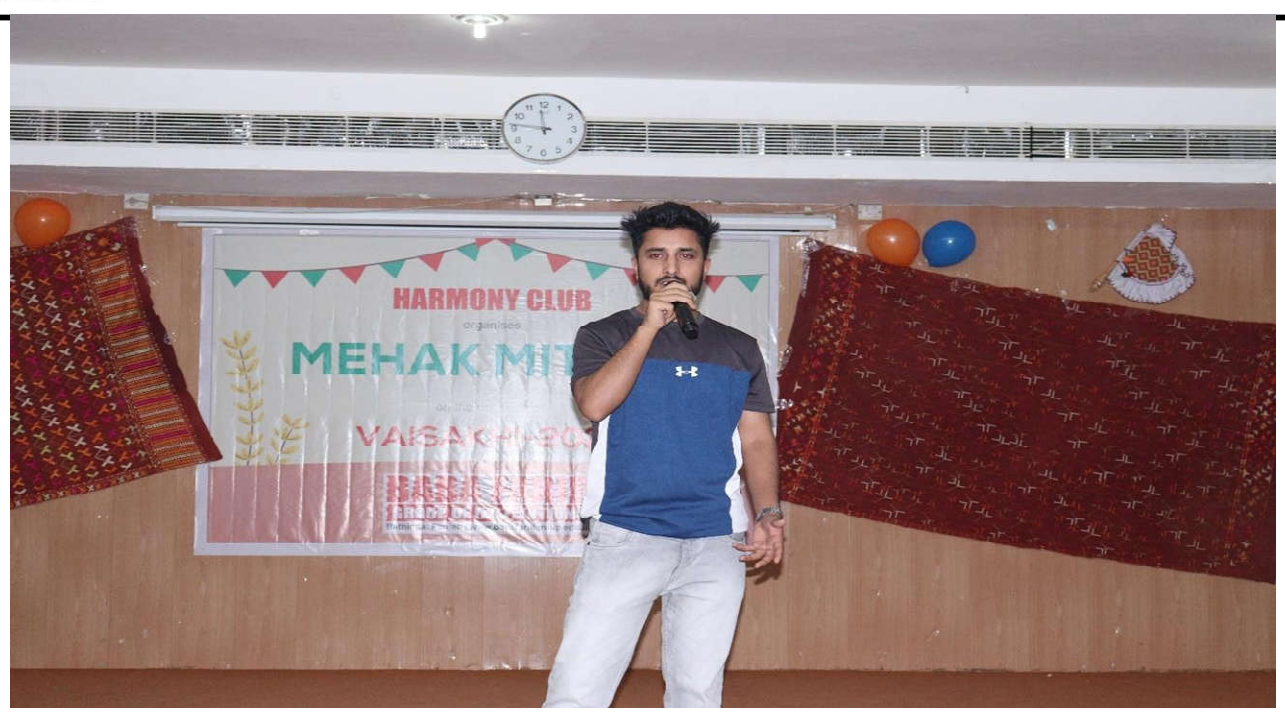
Student during his performance in Mehak Mitti Di Event