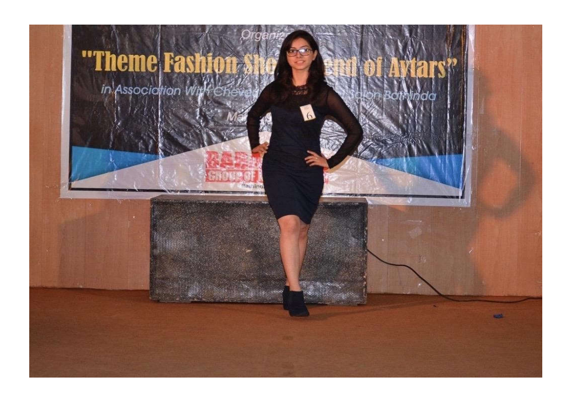
Participantduring herperformance onthedayofevent