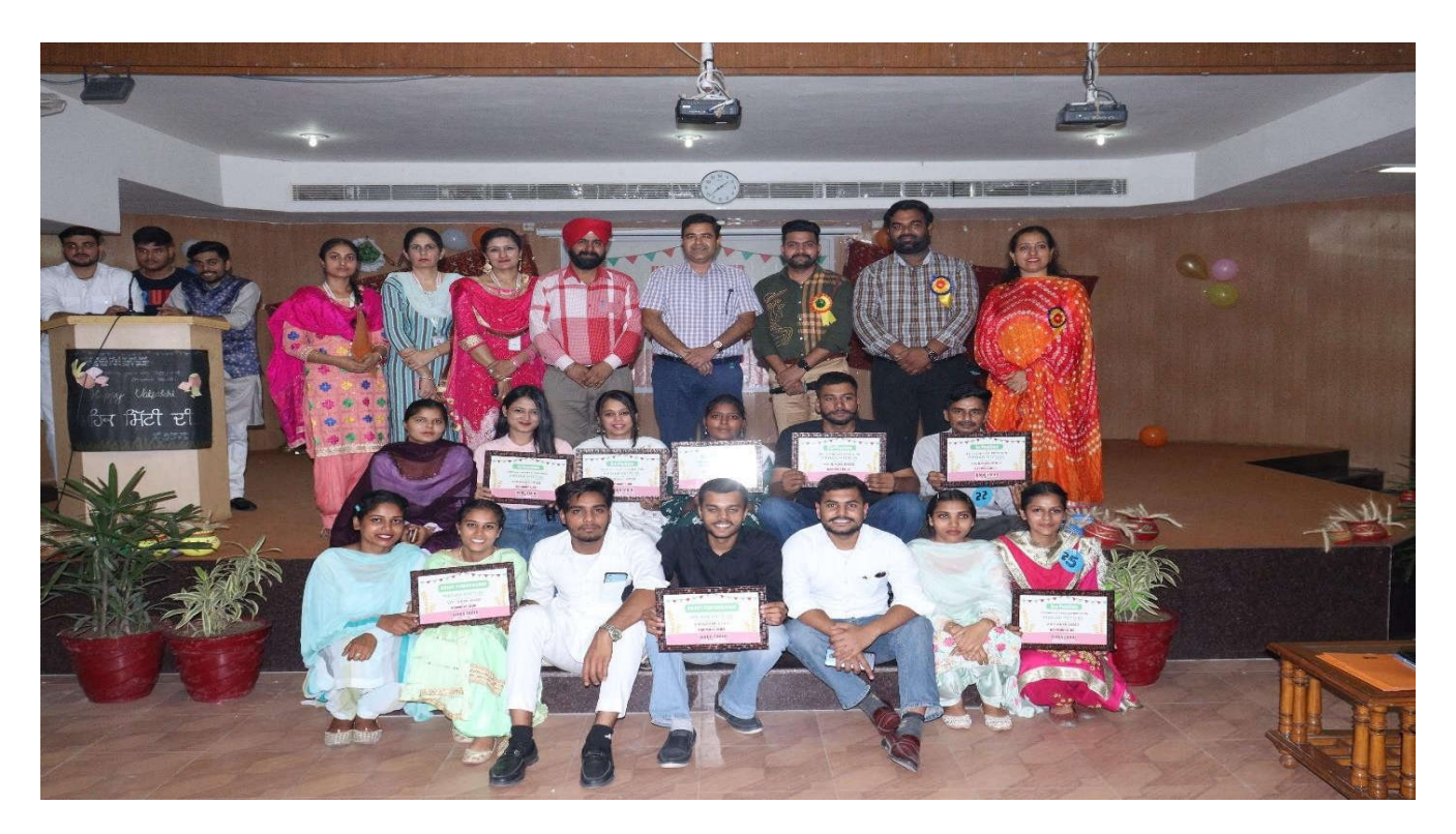
DuringtheGroupphotograph of participants with higher authorities