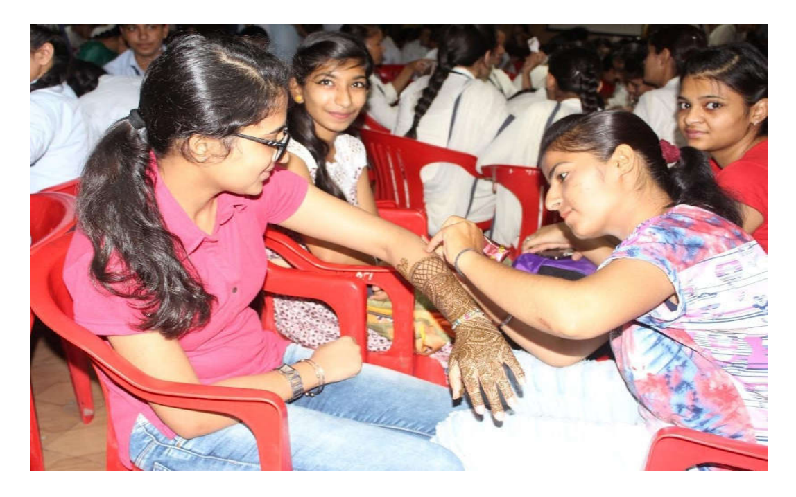
Girls\ applying Mehndiduring Karwa chauth celebrations

GirlsduringMehndicompetitionon theday ofcelebrations