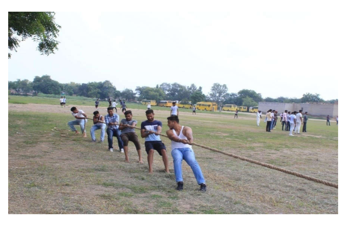
Boysplaying thetugofwarmatchinmainground BFGI

In this Tug of war tournament student from CSE, 10 from CE, 12 from EE/ECE 8and 10 from ME had participated with full enthusiasm and shown sportsman spirit. In the pre-final round Team of CSE, CE and ECE compete with each other to win the medals. In thefinal round Team of CSE was declared as the winner and Team of CE was declared as 1<sup>st</sup>runner up and Team of EE was declared as 2<sup>nd</sup> runner up all the student appreciated the eventorganizedbysportsclubof BFCET.