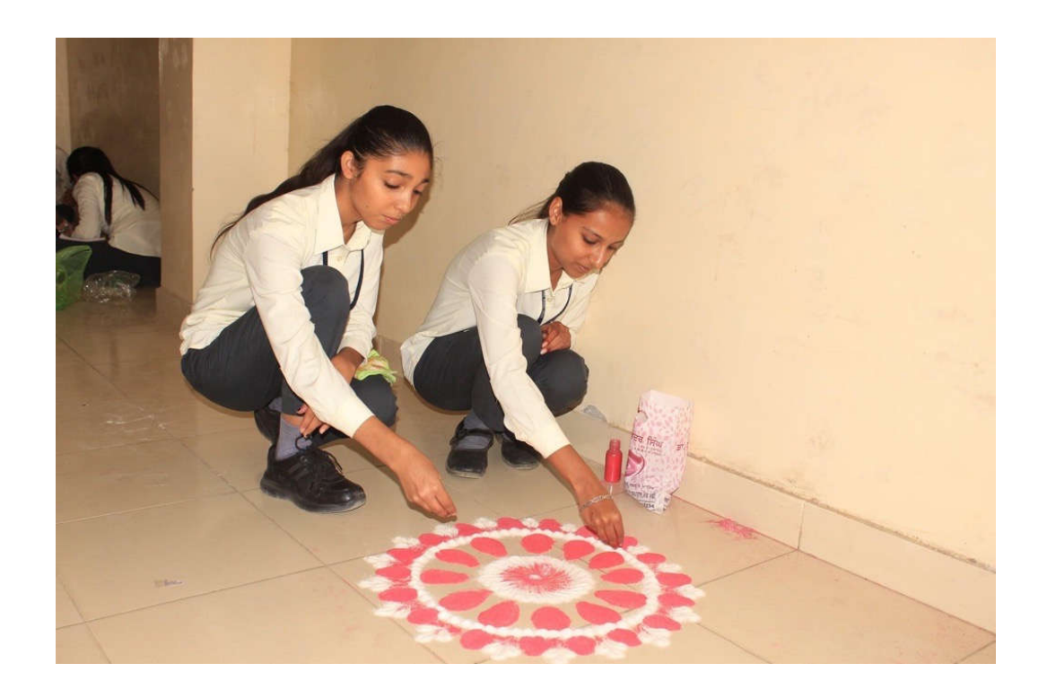
Girls during Rangoli making on the day of event