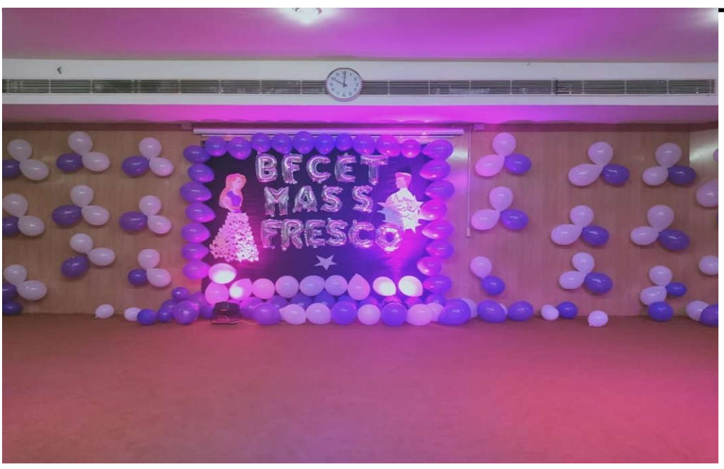
Stagedecorationforthefresher's party 2019