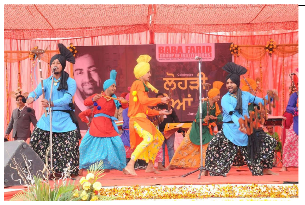
Boy sper forming bhang raduring the celebrations of festival