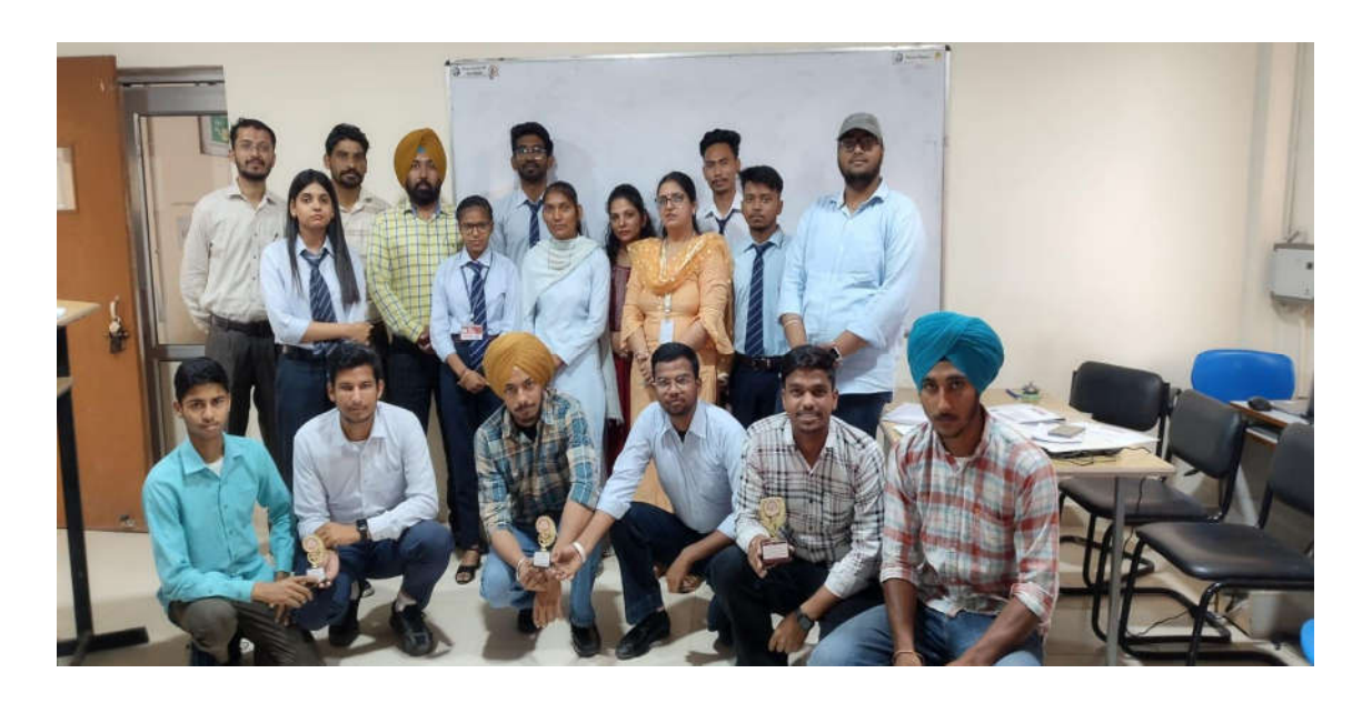
Winners of Quiz competition during honoring ceremony on the day of event