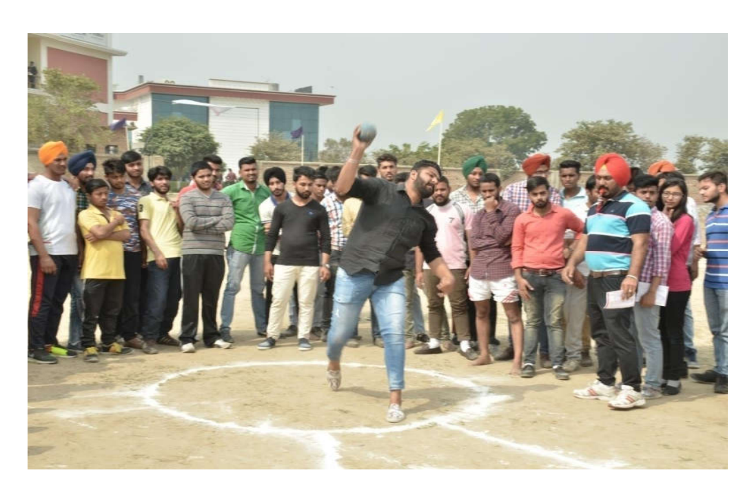
Boysthrow theshotput event

In this Athletic Event Competition (Boys/Girls) 10 student from CSE,5 fromCE,5 from ME had participated with full enthusiasm and shown sportsman spirit. Inthe pre-final round Team of CSE, CE and ECE compete with each other to win the medals. Inthe final round Team of CSE was declared as the winner and Team of EE/ECE was declared as 1<sup>st</sup> runner up and team CE was declared as 2<sup>nd</sup> runner up.All the student appreciated theeventorganizedbysportsclubof BFCET.