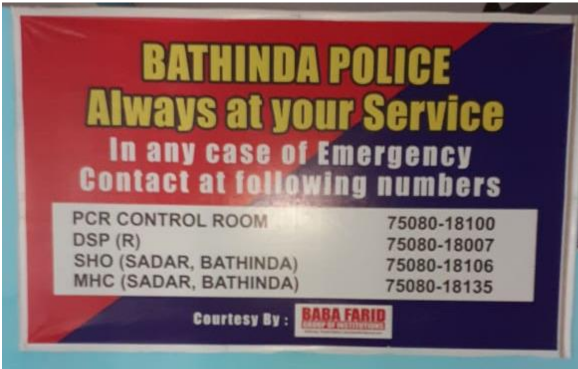
Helpline Numbers for students displayed at Boy's Hostel