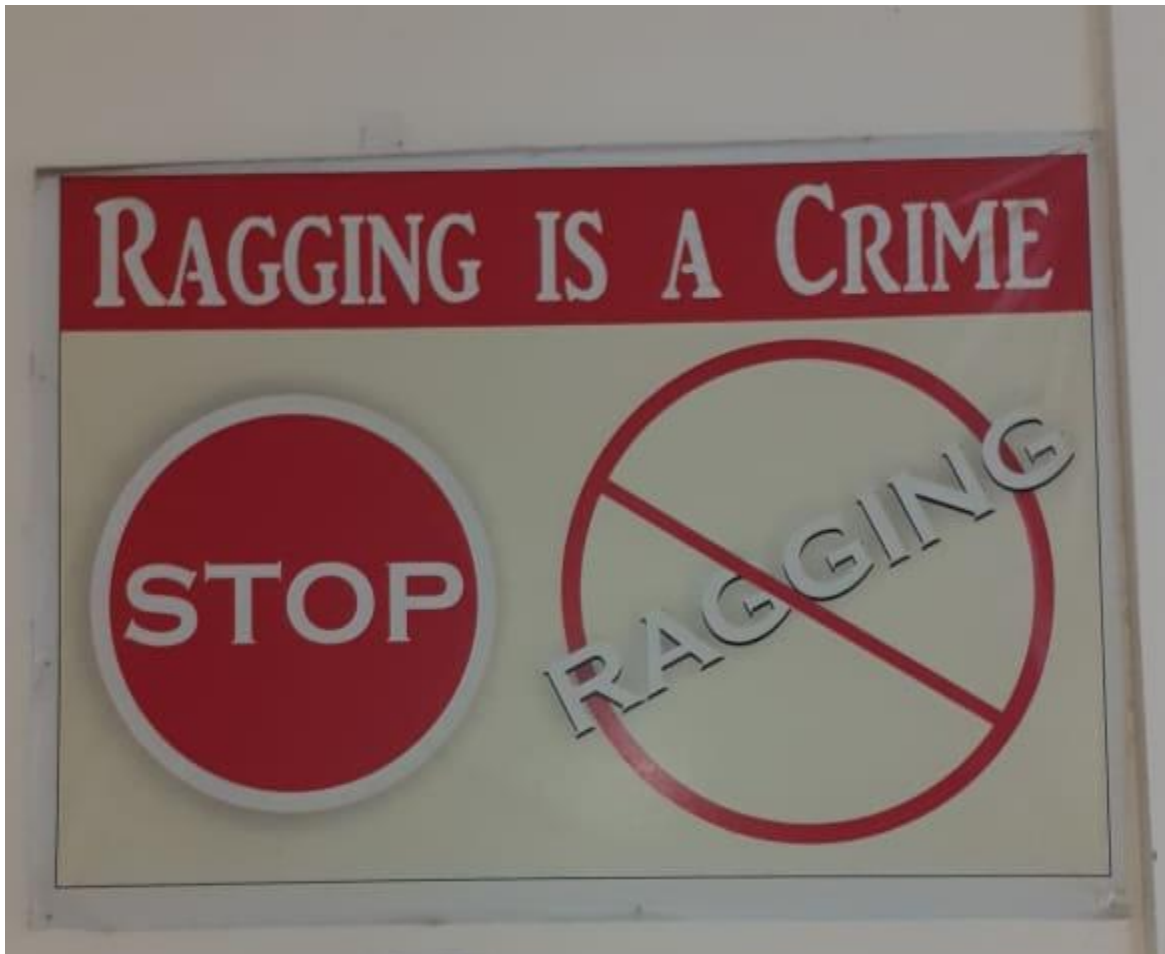
Awareness of Ragging at 1 st Floor Block-E