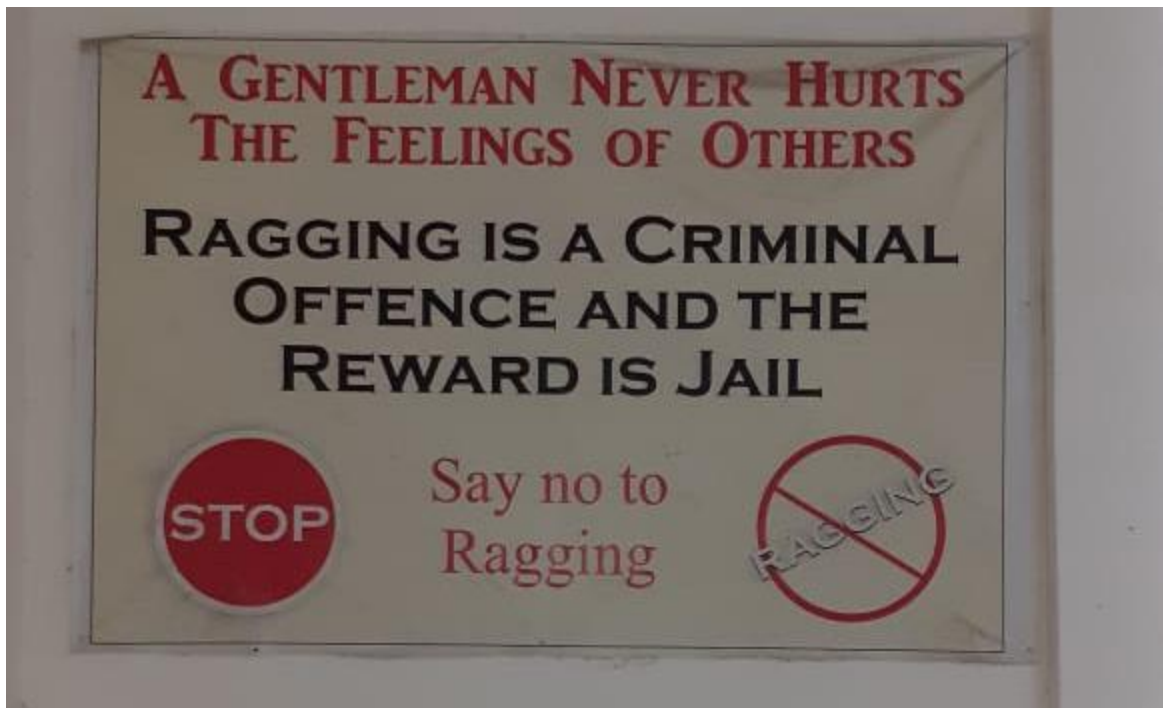
Awareness of Ragging at 2nd Floor Block-E