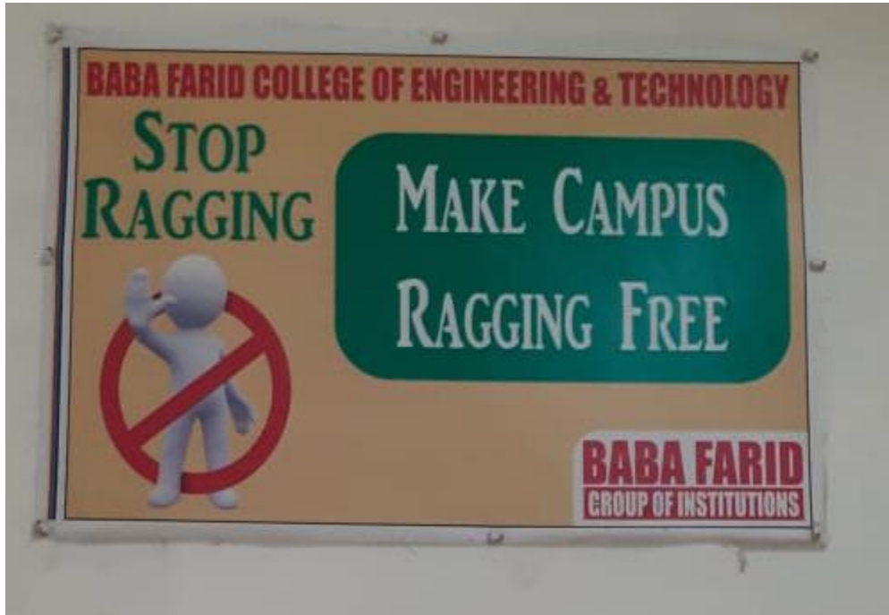
Awareness of Ragging at Ground Floor Block-F