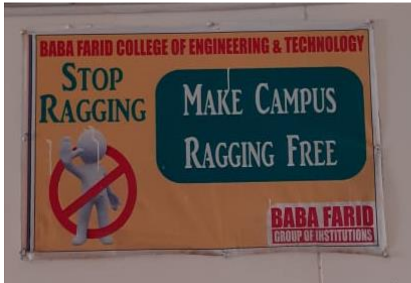
Awareness of Ragging at 1st Floor Block-F