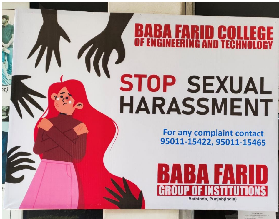
Stop Sexual Harassment at Ground Floor Block-E