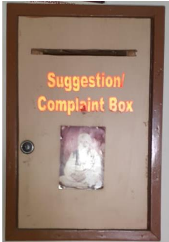
Suggestion/Complaint Box at Girls Hostel