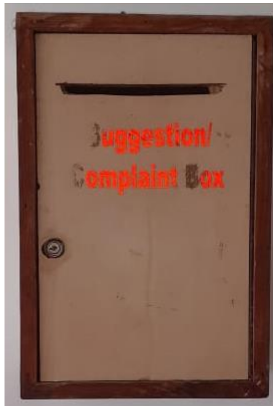
Suggestion/Complaint Box at Innovation Centre Ground Floor