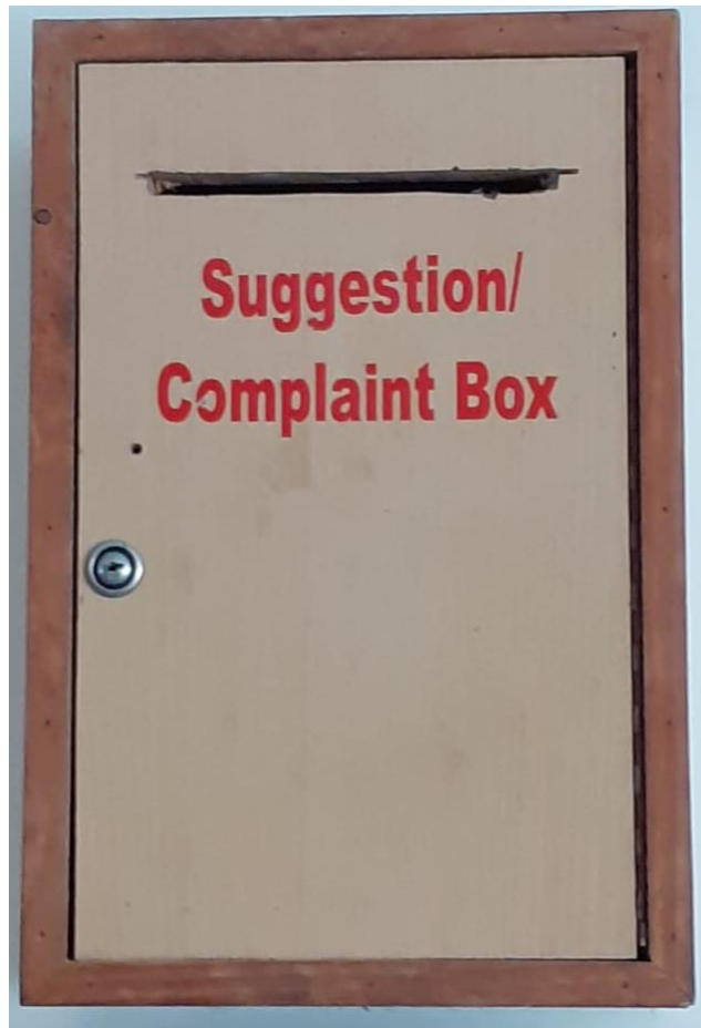
Complaint/Suggestion Box at Ground Floor Block-E