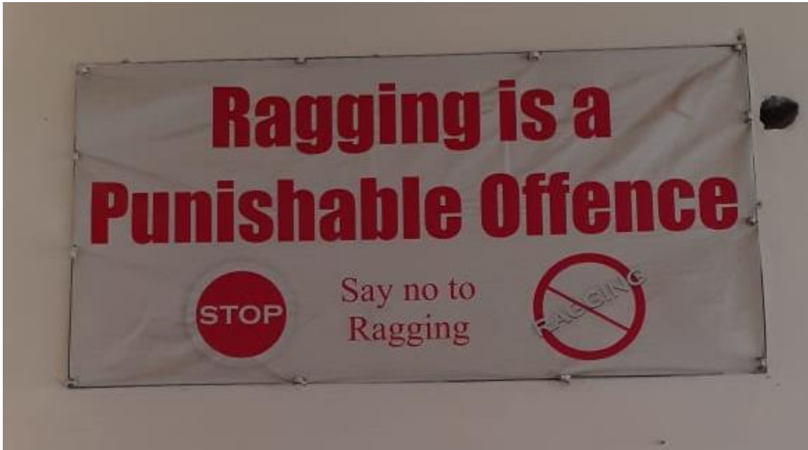
Awareness of Ragging at Ground Floor Block-F