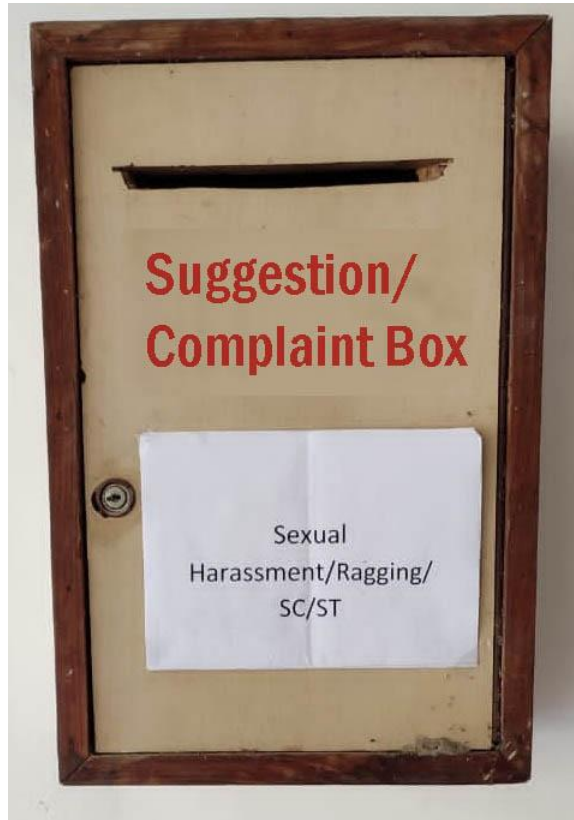
Sexual Harassment/Ragging/SC/ST Suggestion/Complaint Box