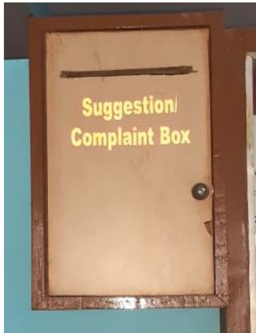
Suggestion/Complaint Box at Boy's Hostel