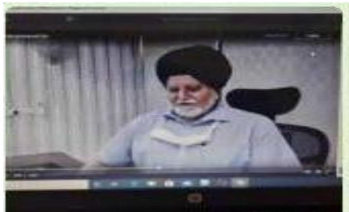
Glimpse of One day Seminar on Entrepreneurship