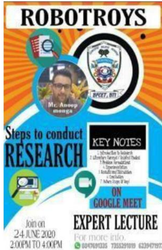
Poster of Expert Lecture on Steps to Conduct Research