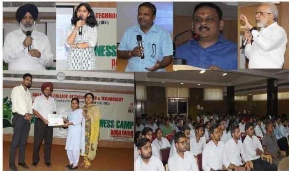
Glimpses of Entrepreneurship Awareness Camp