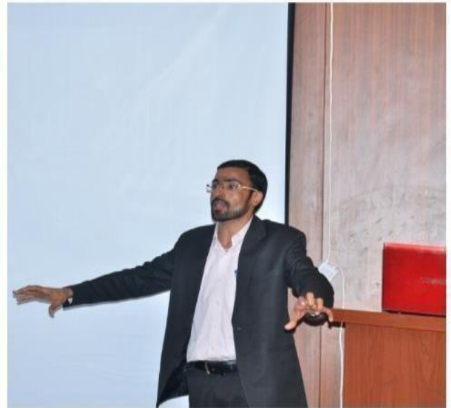
Glimpses of Workshop on How to Start a Start-up