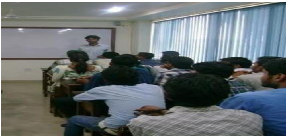
Glimpse of Seminar on Entrepreneurship