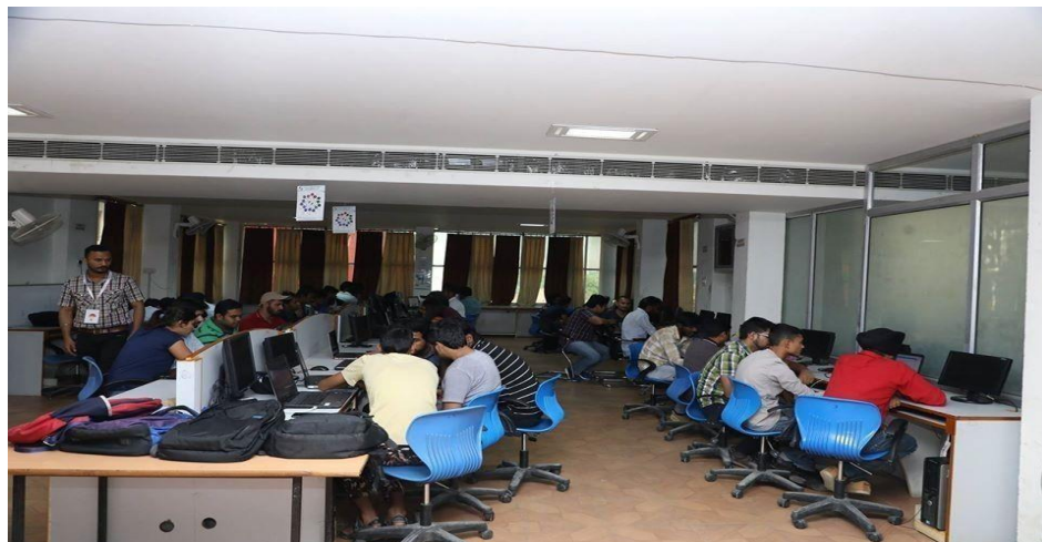
Glimpse of Workshop on Digital Marketing and its Importance for Business and Entrepreneurship