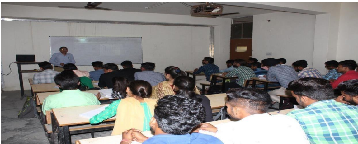
Glimpse of Seminar on Entrepreneurship: Steep Rise of Entrepreneurship in Generation of Solar Energy