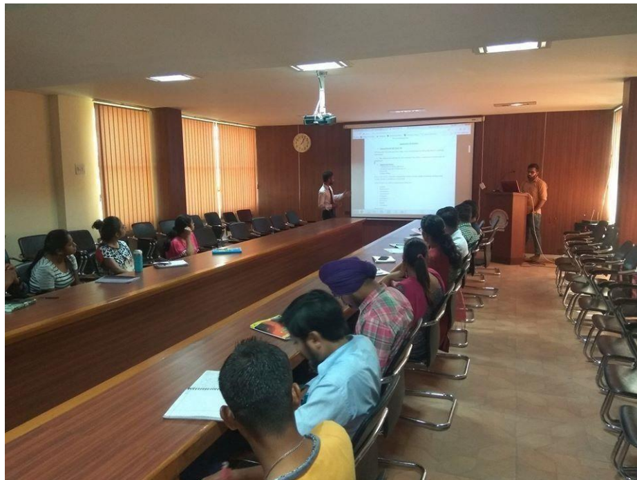
Glimpses of Entrepreneurship Week