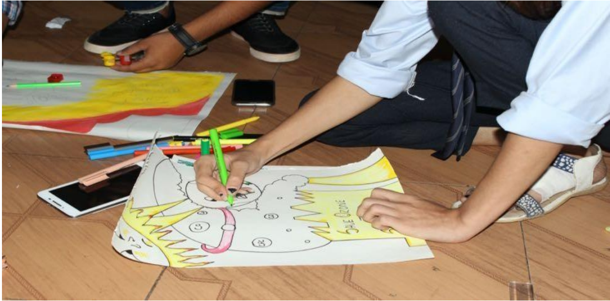
World Ozone Day: Glimpses from the Poster Making & Debate Competitions during the