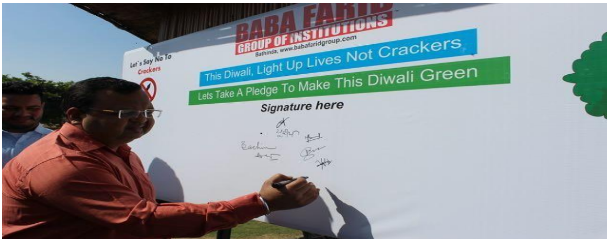
Anti-Cracker Campaign: Signed and pledge taken by Principal of BFCET