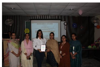
Clips from the ongoing Seminar on Healthy Life