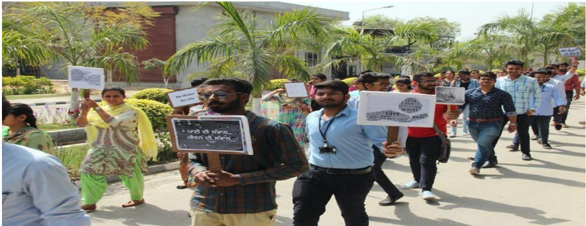
World Water Day: An awareness rally to sensitize the individuals about water conservation