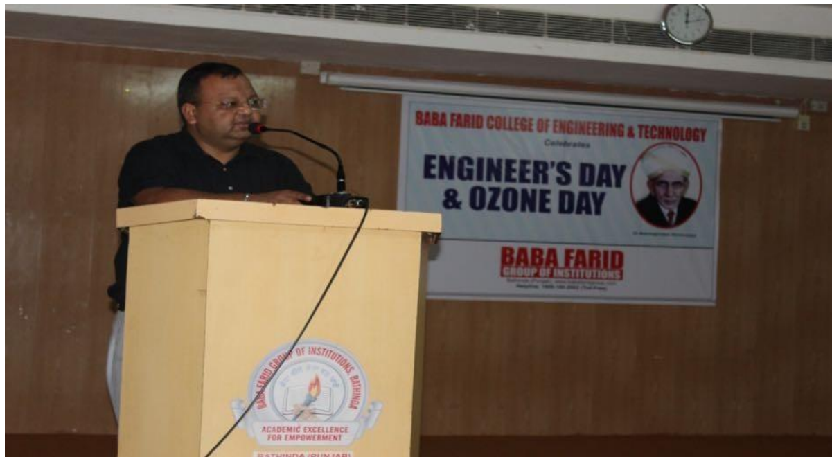
World Ozone Day: Principal BFCET shared his valuable views with the students & faculty members during the celebration