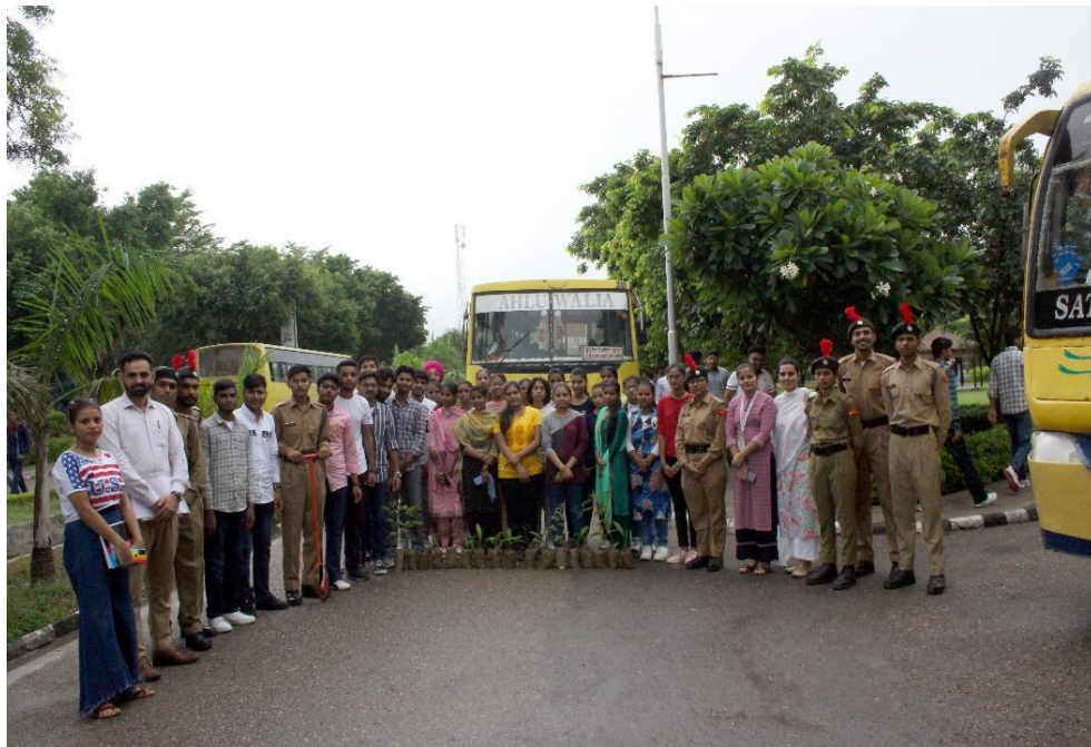
Students of BFCET have done Tree Plantation during World Environment Day