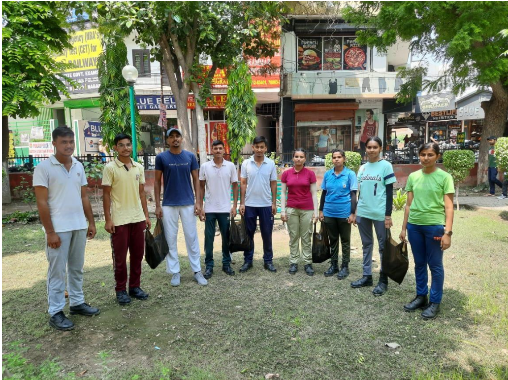
World Environment Day: Students of BFCET attending Swachh Bharat Abhiyan during World Environment Day