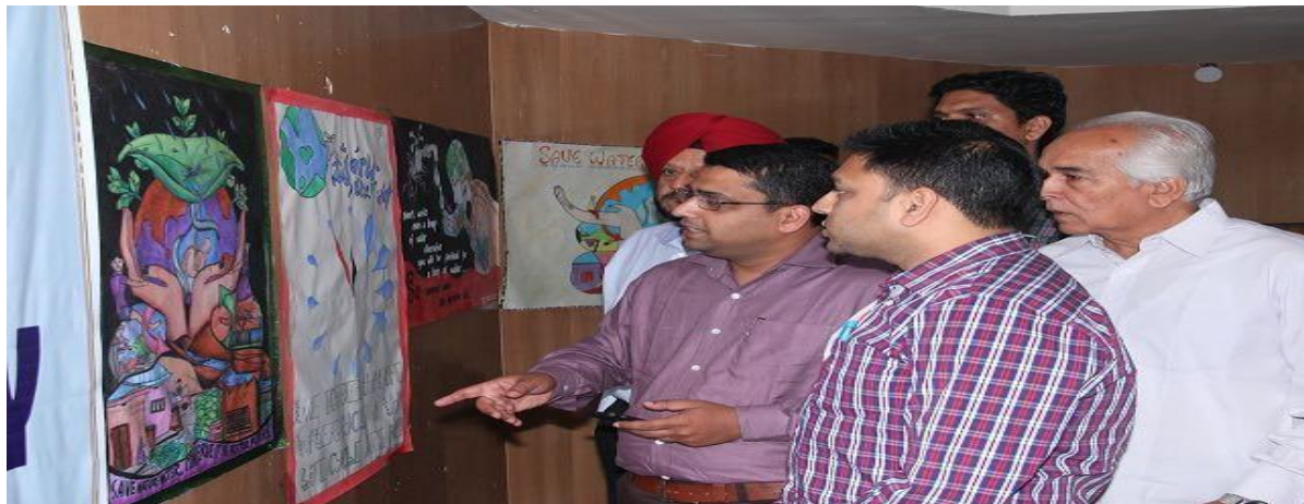
World Water Day: A glimpse of the poster exhibition during the celebration