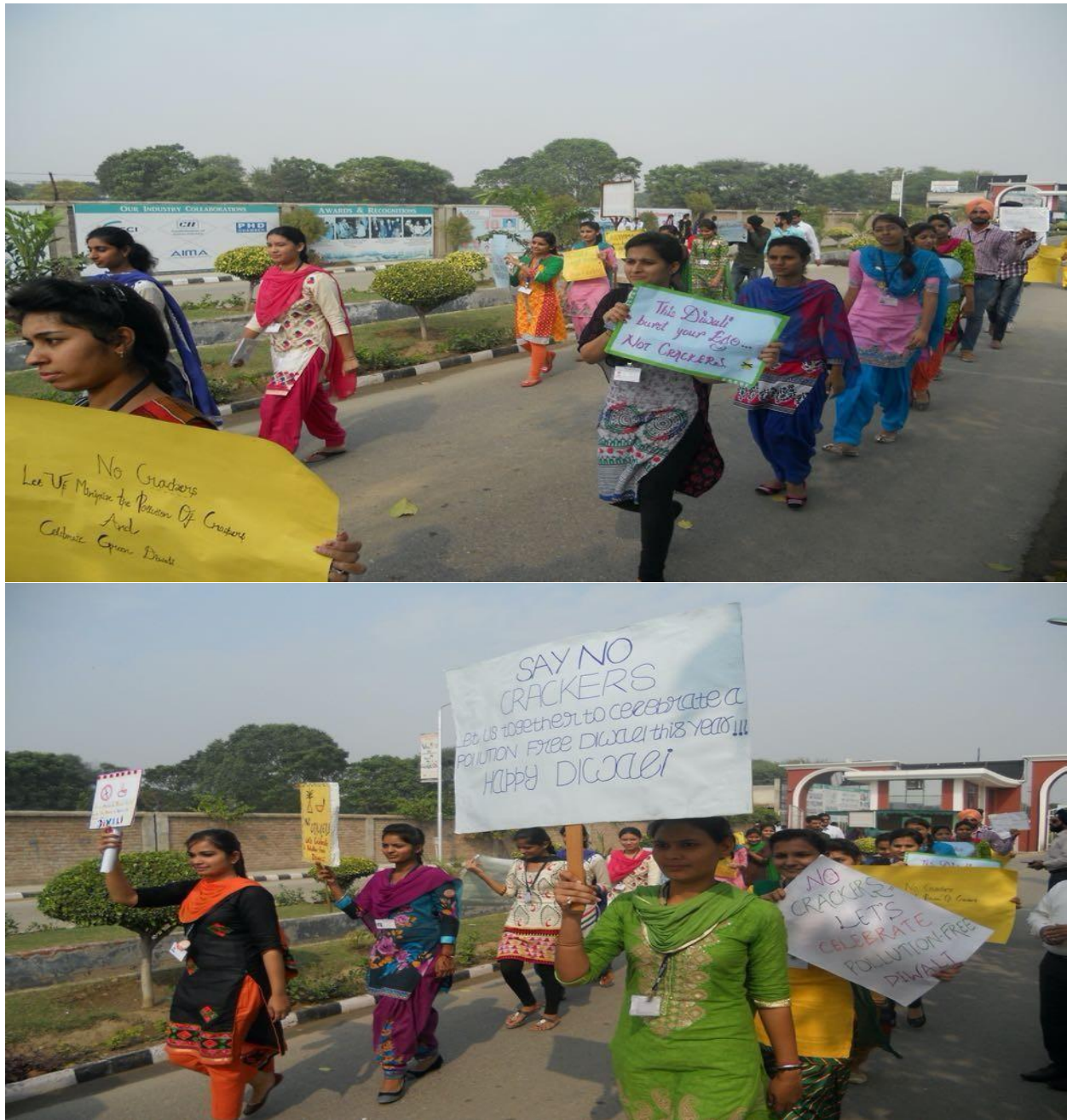
Green Diwali: Anti-Cracker Campaign: Volunteers raising the Slogans using Placards in the campus to create the awareness during this Campaign dignitaries along with the winners