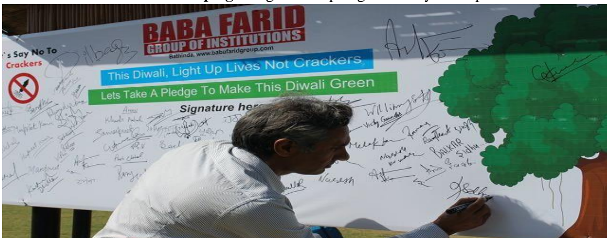
Anti-Cracker Campaign: Signed and pledge taken by Head of Software Development Team