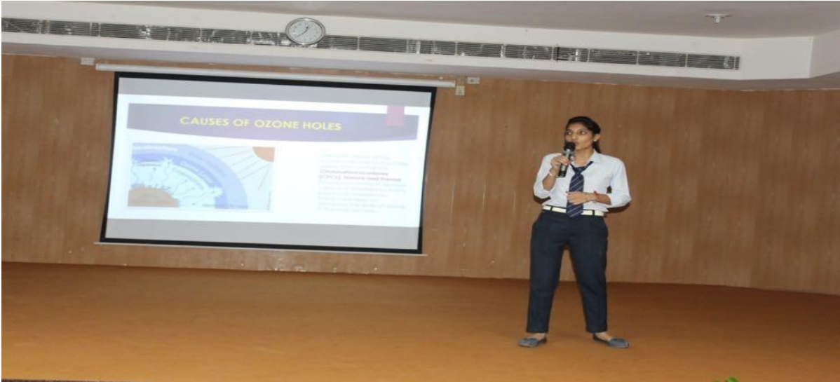
World Ozone Day: Participants from an Elocution Competition held on that day