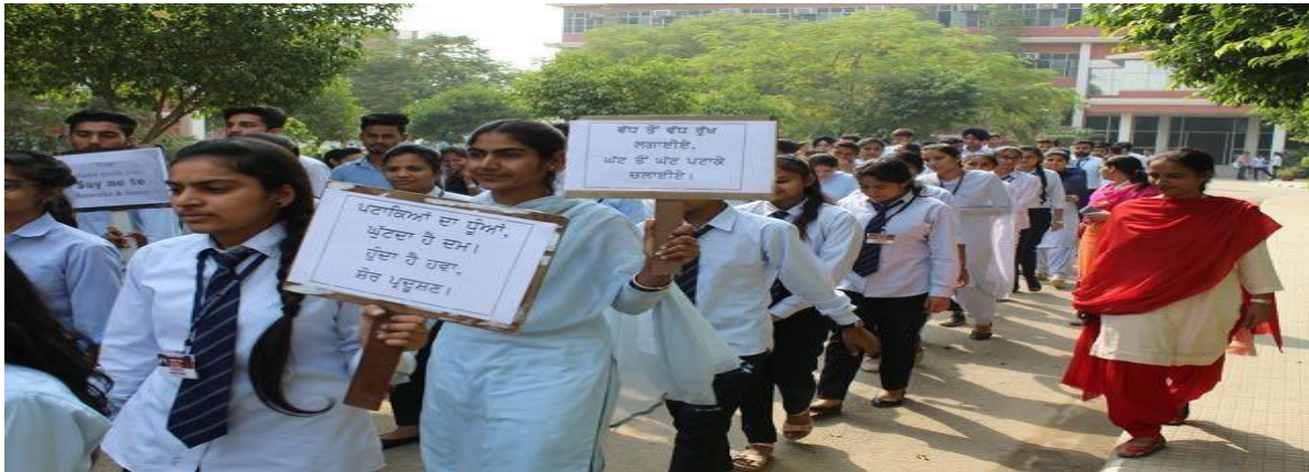
Anti-Cracker Campaign: Save Environment rally by students